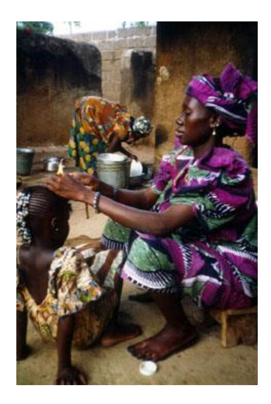
Figure 6: Dressing up for a festive ay. 1994, Badialan, Bamako.